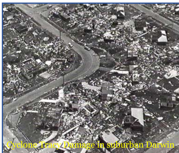
Cyclone Tracy Damage in suburban Darwin

Darwin was the scene of the biggest airlift in Australian history after Cyclone Tracy devastated the city in the early hours of Christmas Day 1974. Cyclone Tracy caused almost total destruction taking 71 lives and injuring thousands more. Many of those who died or were injured were struck by flying debris. It was Australia's worst natural disaster.